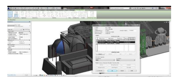
Figure 2.3D ©Revit model of the Basilica St. Maria and WBS to manage the restoration (Oreni et al., 2014)

There are different BIM applications in the cultural heritage context and this section describes characteristic cases. One of them is the Basilica of St. Maria of Collemaggio in L'Aquila of Italy that was damaged by the earthquake in 2009. In this survey created a 3D detailed model (Figure 2) to support the on-going design project of conservation and intervention of the damaged temple parts. The HBIM model manages the stages of simulation of structural behaviour, analysis, economic evaluation of the project, and restoration of the temple (Oreni et al., 2014).