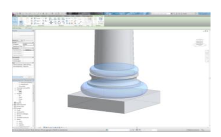
Figure 5. Final HBIM Model of pillar (Garagnani and Manfredini, 2013)

One more case describes the procedures for the visualisation of Sant' Apollinare Nuovo in Ravenna of Italy: the Byzantine church with walls covered with mosaics. For the monument's modelling, the data were acquired using a Leica ScanStation C5 laser scanner which where integrated with the dense point surfaces obtained through digital photogrammetry, using Menci Z-Scan software. The final result was a model (Figure 5) of the inner nave, including some details captured with a higher number of points: point clouds were superimposed in order to get a complete documentation of the walls and mosaics. The point clouds were registered, decimated and processed in order to be transformed in a proper geometric input for Autodesk Revit Architecture 2012. A simple plug-in for Revit, the GreenSpider, was used to layout points in space as if they were nodes of an ideal cobweb. The parametric production of smart elements is easier and much more accurate. This application is able to translate points into native reference snaps aimed to allow elements modelling with much more precision instead of a simple tracing out (Garagnani and Manfredini, 2013).